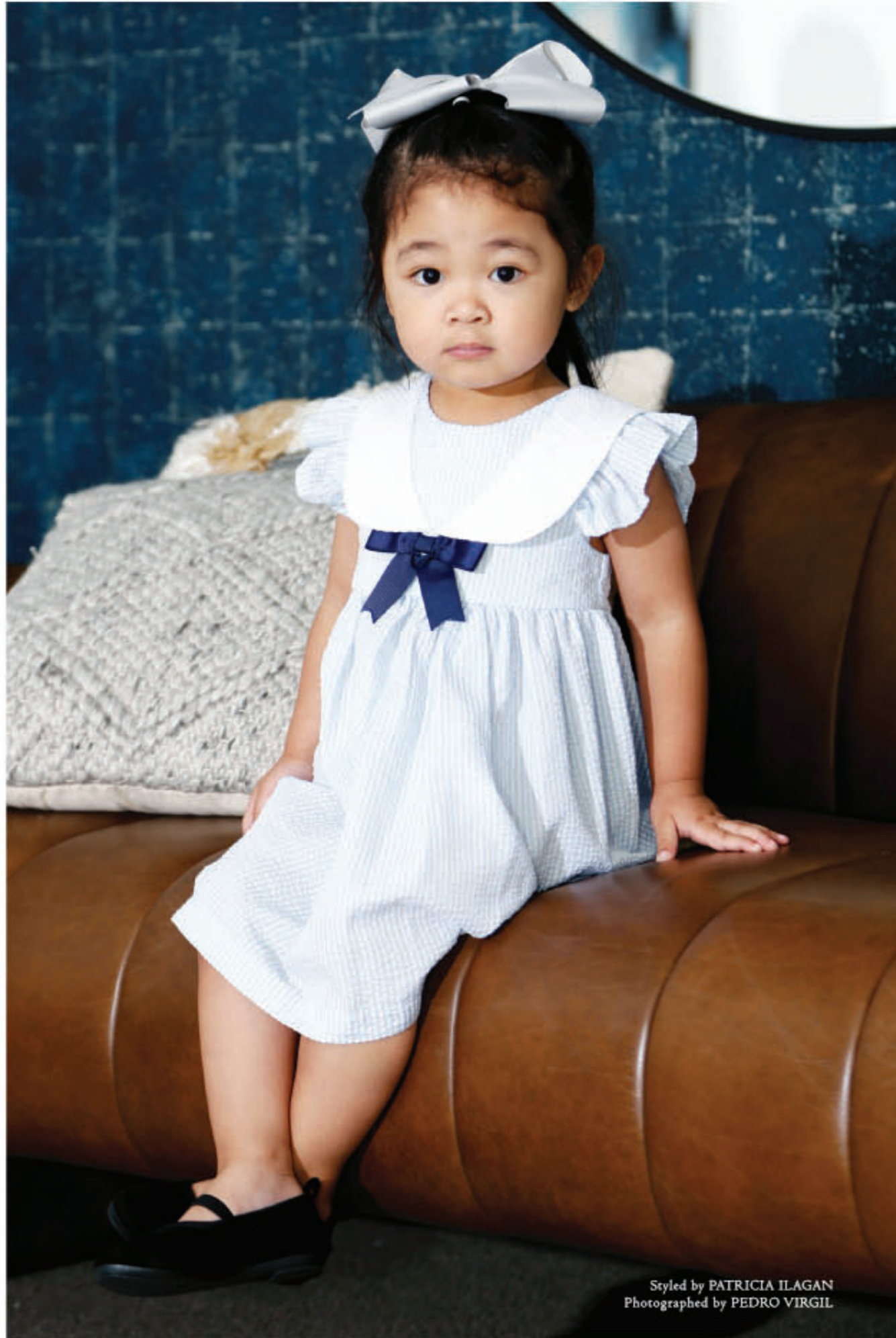
Styled by PATRICIA ILAGAN Photographed by PEDRO VIRGIL

Does this sound like you? Well, your next step is to discover what you can do to help limit the waste, and can you believe it? It's shopping! By changing your shopping habits from buying brand new retail in bulk to buying preloved clothes. This means clothes that have previously been owned before, sometimes worn but are still in good condition for use. Now, before you get grossed out or feel ashamed to be wearing secondhand, think about all the clothes in your wardrobe that you haven't worn or have even given away or thrown out. Would you offer it to your friends and family to wear? That's how it should feel.